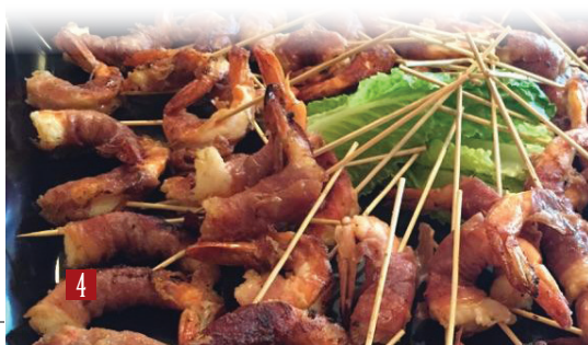
Gamberi e Prosciutto