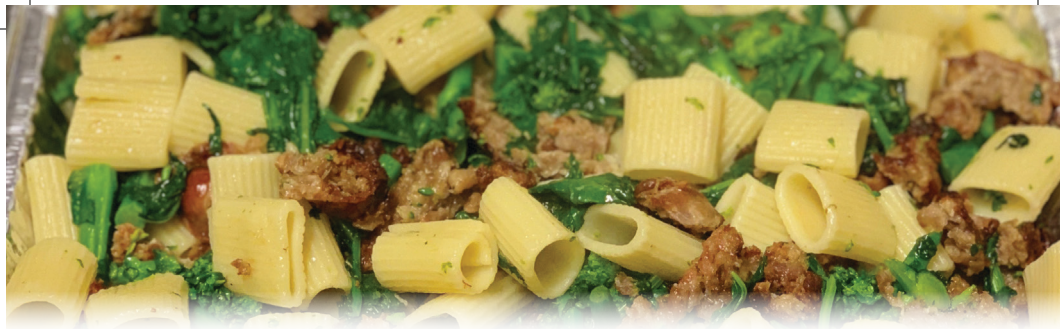
Rigatoni con Sasiccia